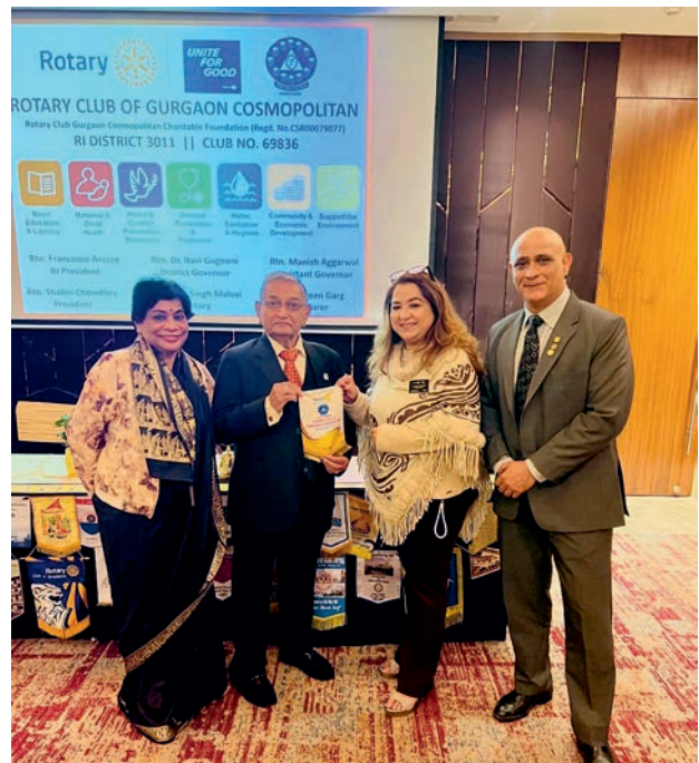
Flag exchange by Maj Gen Rtn P K Patnaik with Rotary club of Gurgaon Cusmopolitan